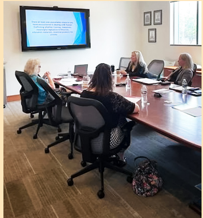
Focus Group Petersburg