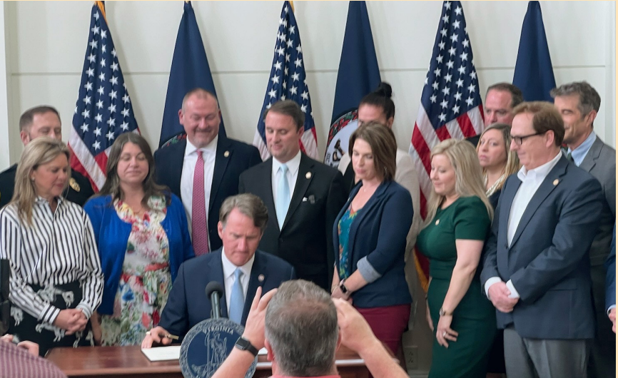
Governor Youngkin signing the first Labor Trafficking Law in Virginia