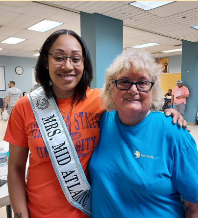
No Excuse for Abuse Walk with our Vice Chair