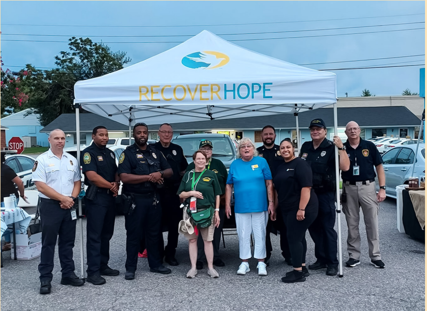
National Night Out Colonial Heights Police