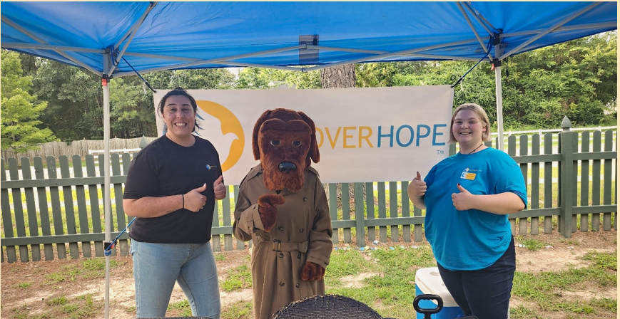
National Night Out Chesterfield Police